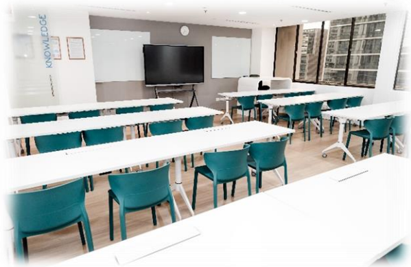
Classrooms: Place where classes are conducted