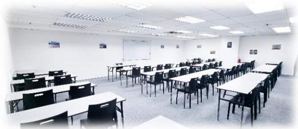
Classrooms: Place where classes are conducted